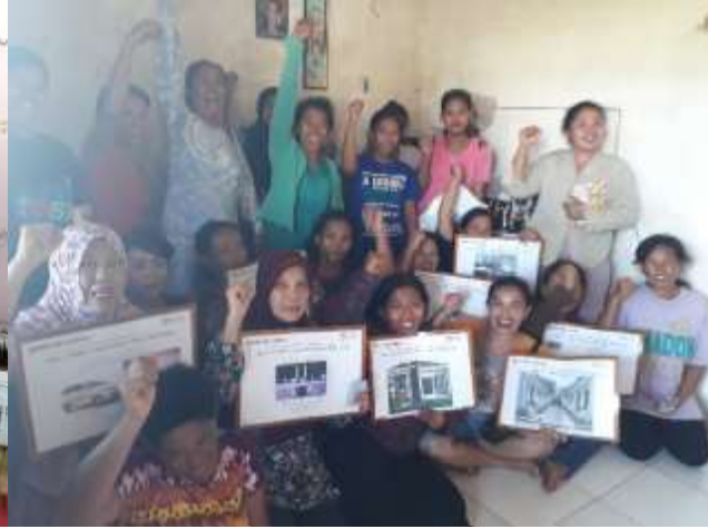
Group B015 & B016 – 22 people – Bulak Turi & Turi Jaya