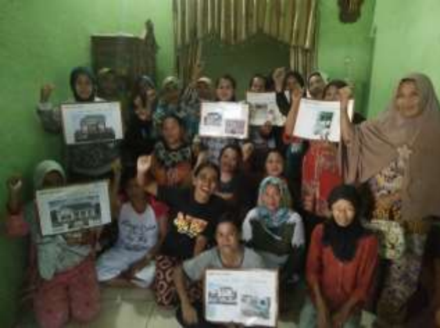
Group A044 & A153 – 21 people – Mangga & Mantang