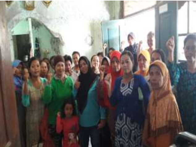
Group B215 & B216 – 21 people – Kebantenan