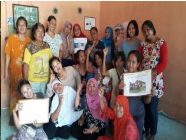
Group D012 & D017 – 20 people – Kampung Sawah & Kebon Rusun