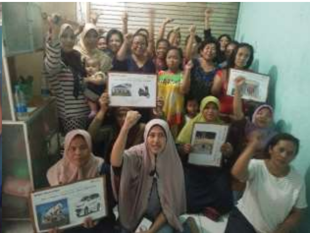
Group C130 & C131 – 20 people – Balai Rakyat & Syawal