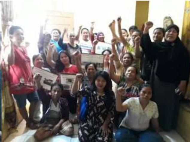
Group B261 & B262 – 21 people – Bulak Cabe