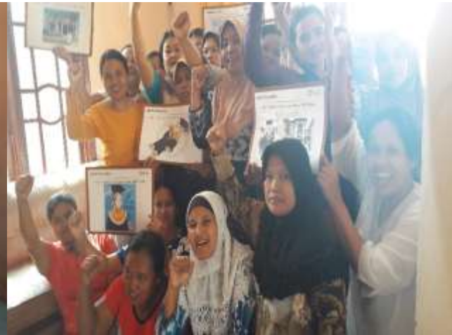
Group D013 & D024 – 20 people – Sarang Bango