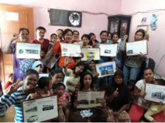
Group B001 & B034 – 19 people – Kampung Sepat