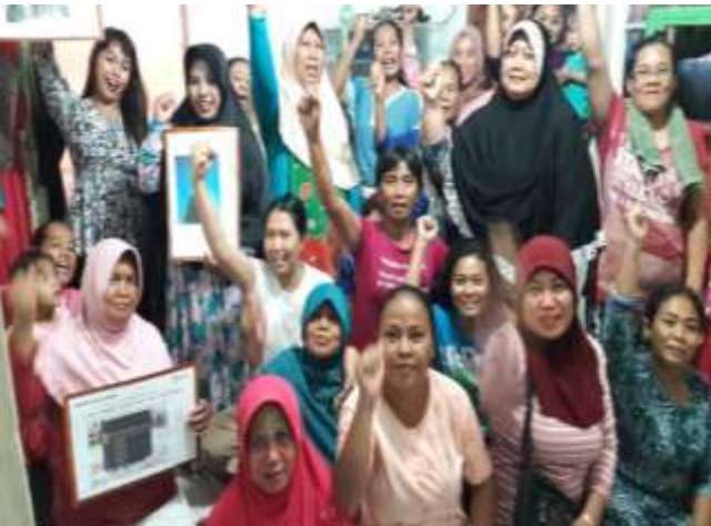
Group D014 & D023 – 20 people – Sutim