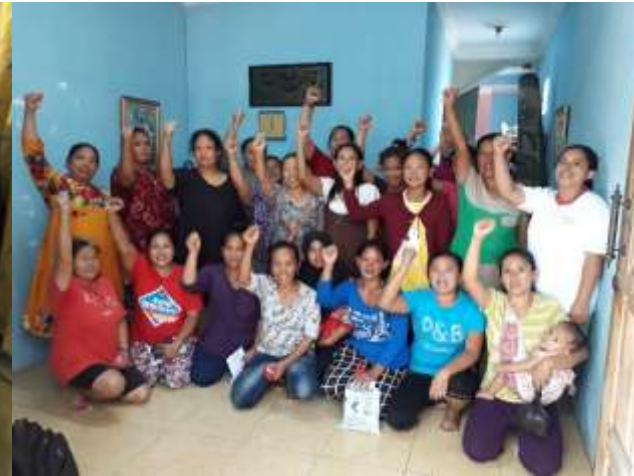
Group B316 & B317 – 22 people – Cilam & Kosambi