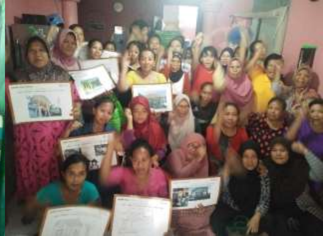
Group A168, A169 & A173 – 31 people – Kincir & Mengkudu