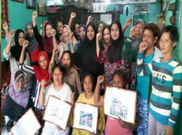
Group A137 & A138 – 20 people – Deli