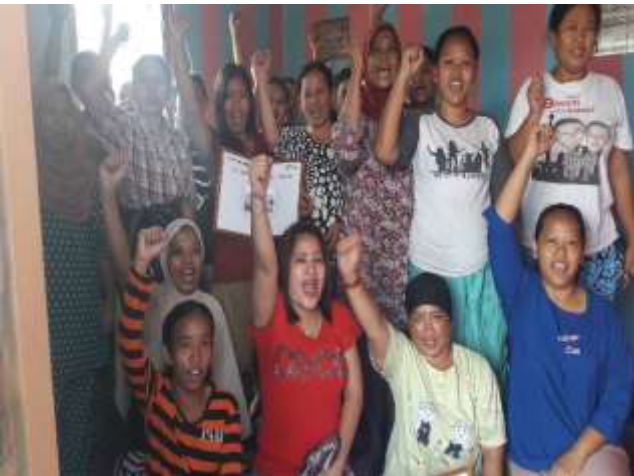
Group C100, C103 & C104 – 28 people – Beting