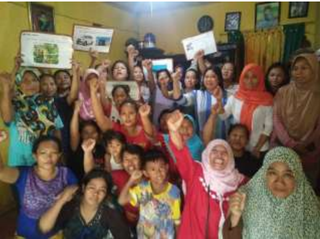
Group D005, D025 & D190 – 28 people – Marunda