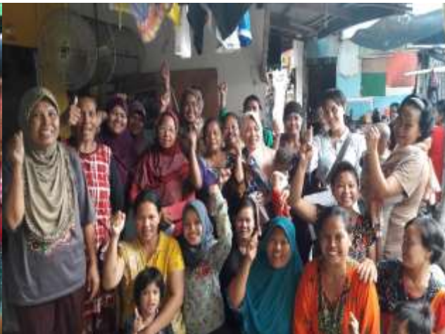
Group D018 & D192 – 21 people – Rorotan