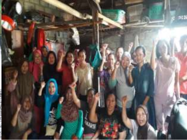
Group A244 & A277 – 22 people – Kobra & Sungai Bambu