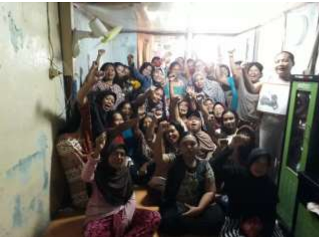
Group F014, F015 & F016 – 33 people – Cipucang & Cibanteng