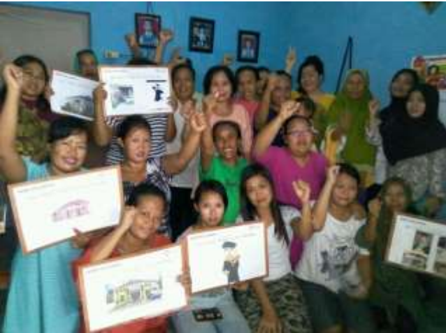
Group C026 & C207 – 22 people – Cemara & Beting