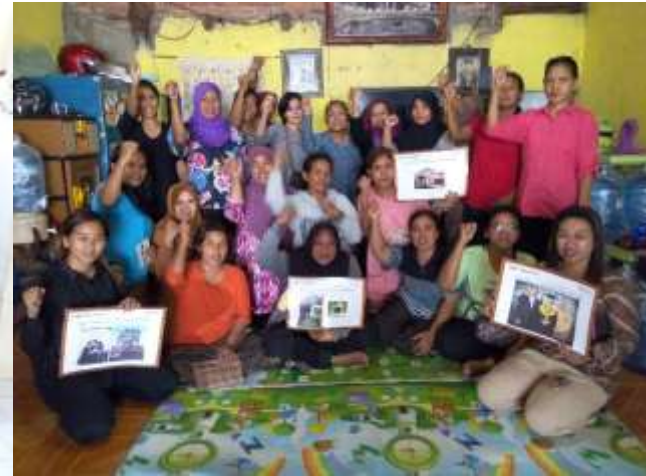
Group C229 & C230 – 22 people – Walang