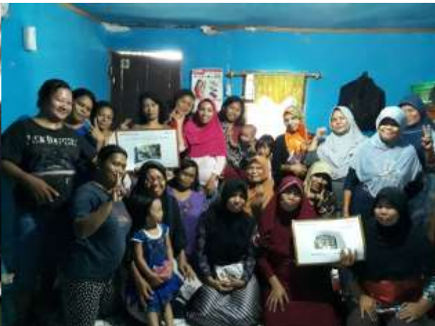
Group F017 & F021 – 19 people – Koramil & Jati