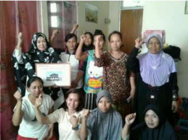
Group D058 & D070 – 20 people – Manunggal