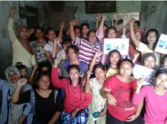
Group D038 & D046 – 19 people – Malaka Bulak