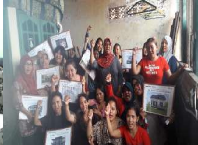
Group A066 & A095 – 19 people – Sungai Bambu & Jati