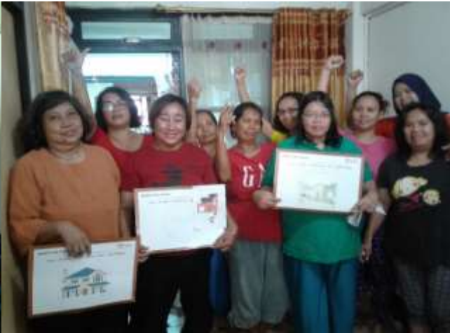
Group D059 & D060 – 16 people – Kampung Sawah