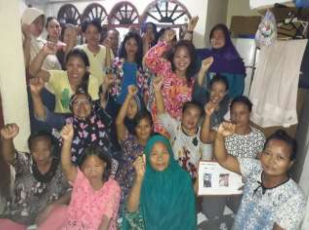
Group A011 & F023 – 22 people – Pembangunan