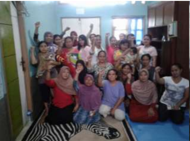
Group D065 & D066 – 21 people – Pelelangan