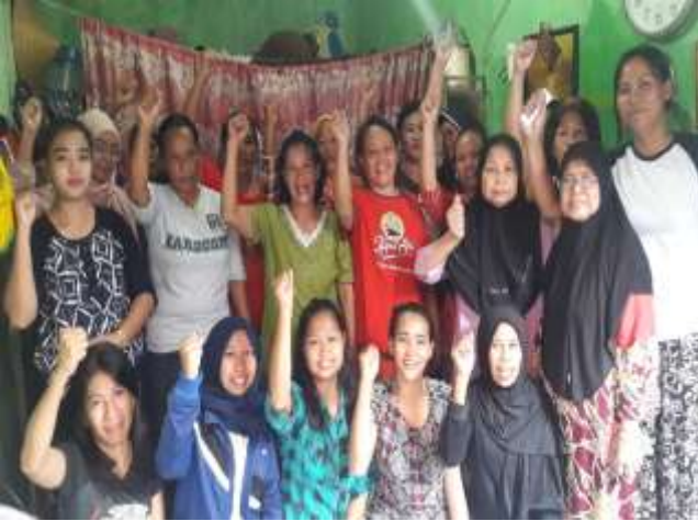
Group A221 & A271 – 20 people – Lorong