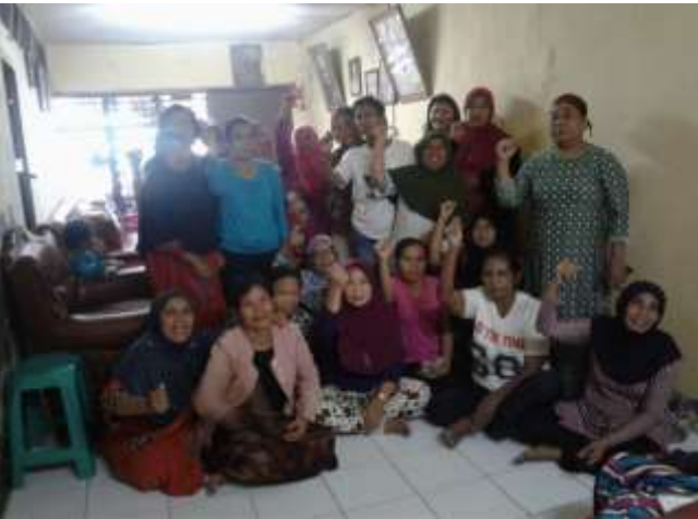
Group D071 & D203 – 21 people – Manunggal & Semprotan