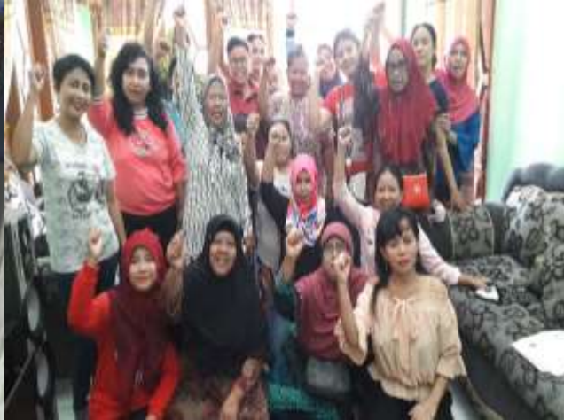
Group A037 & A227 – 20 people – Mahoni