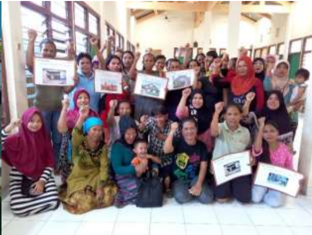
Group C117,C118 & C177 – 28 people – Beting