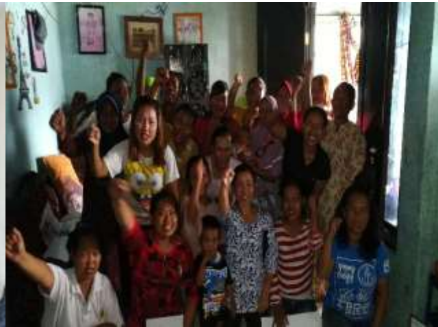
Group CD223 & CD224 – 20 people – Sutim