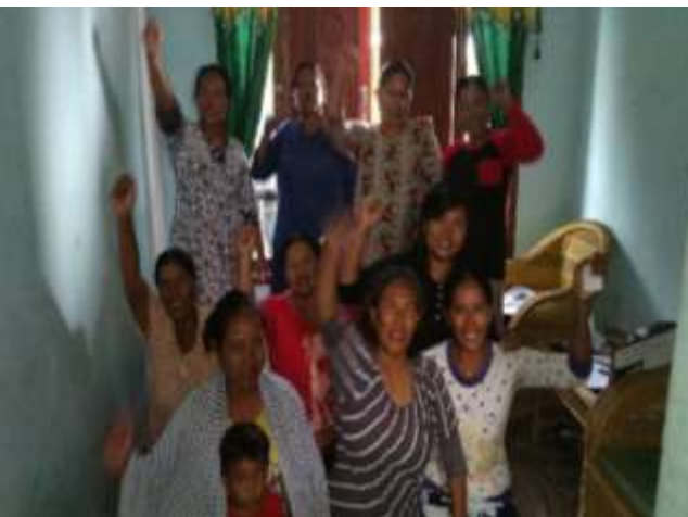
Group CD229 – 10 people – Turi Jaya