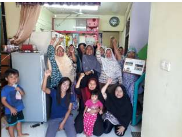
Group CF050 – 11 people – Nakula