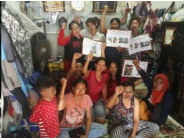
Group CF046 – 10 people – Ji. B