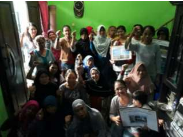
Group CF044 & CF047 – 22 people – Lagter & Mundu