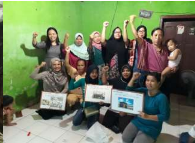
Group CF048 – 11 people – Lorong