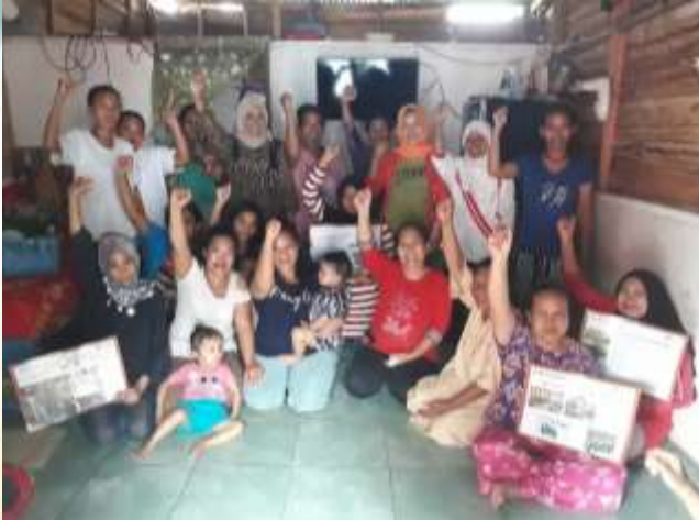
Group CB083 & CB084 – 19 people – Kelapa Kayu & Macan