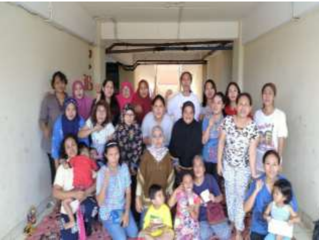
Group CD147 & CD148 – 21 people – Marunda