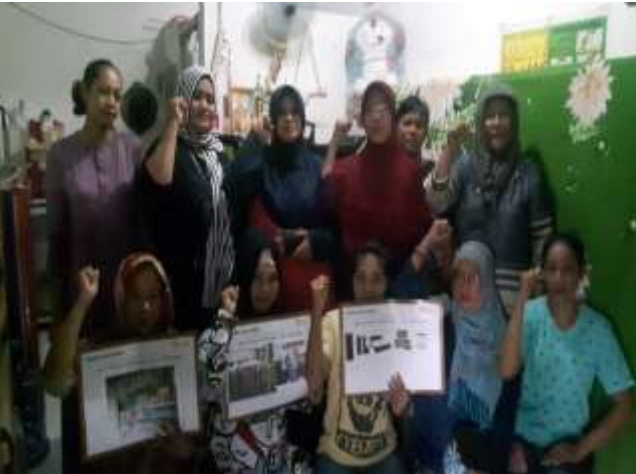
Group CB163 – 11 people – BS