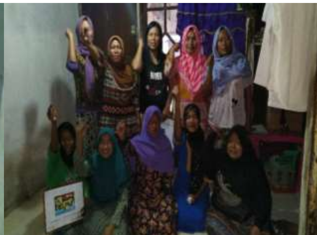
Group CD232 – 10 people – Bedeng