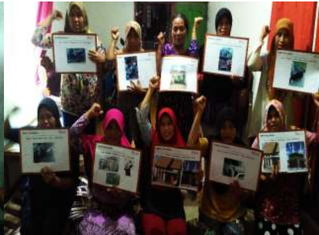
Group CD228 – 10 people – Bambu Kuning