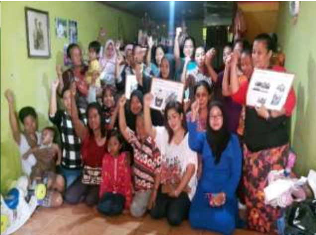
Group CC055 & CC077 – 21 people – UKA 17 & Bulak