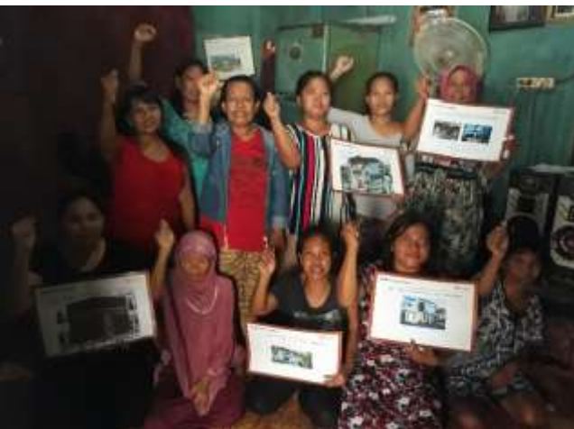
Group CF049 – 11 people – Tanah Merah