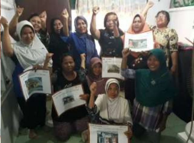
Group CB125 – 11 people – Kebantenan