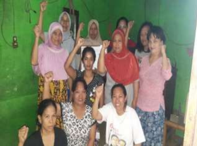
Group CA071 – 11 people – Dault