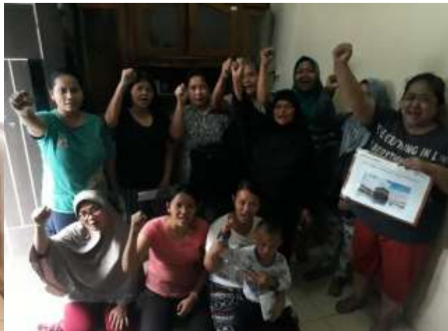
Group CF067 – 11 people – Sindang