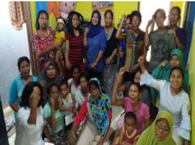
Group CD246 & CD247 – 20 people – Sutim