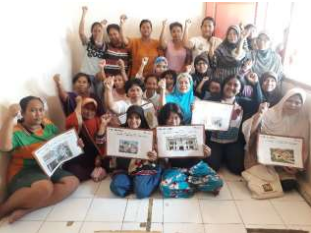
Group CF065 & CF066 – 22 people – Kebon Bawang & Lagoa Kanal