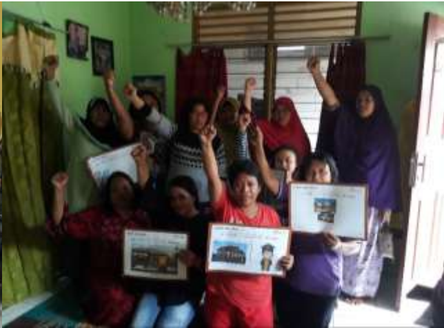
Group CF057 – 11 people – Enggano