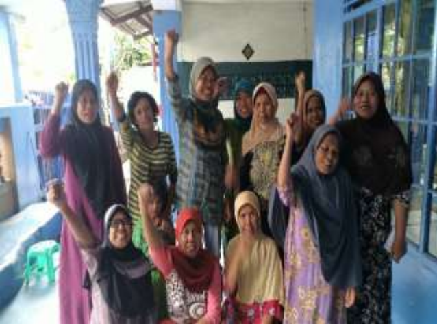
Group CD141 – 11 people – Marunda Baru