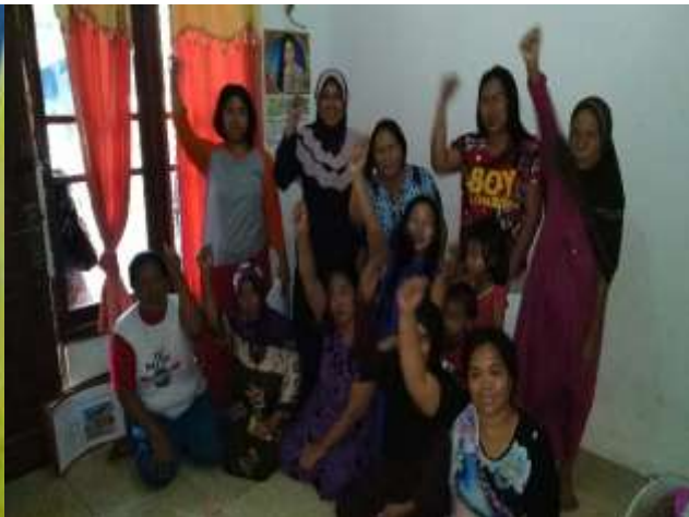
Group CD249 – 11 people – Rorotan