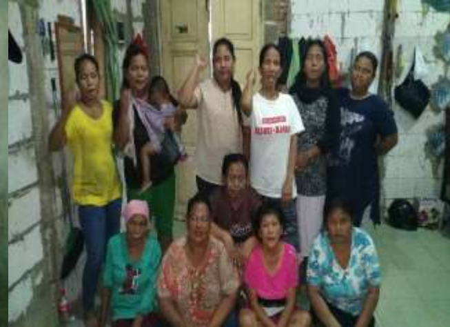
Group CD241 – 11 people – Kebon Rusun