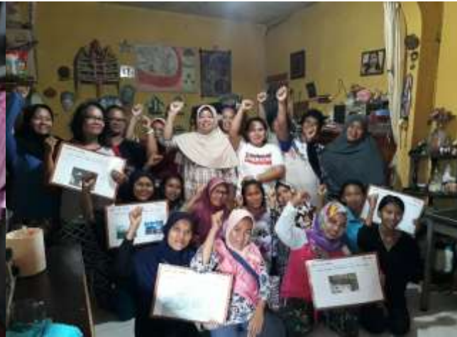
Group CF056 & CF062 – 20 people – Swasembada & Simpang 6