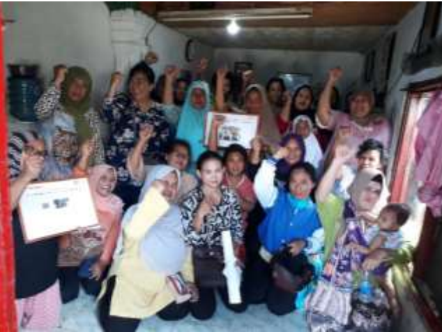
Group CF055 & CF059 – 22 people – Deli & Jalan B