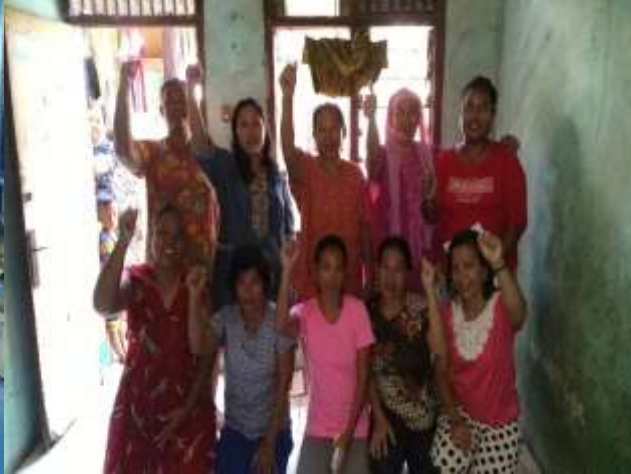
Group CD238 – 10 people – Belah Kapal